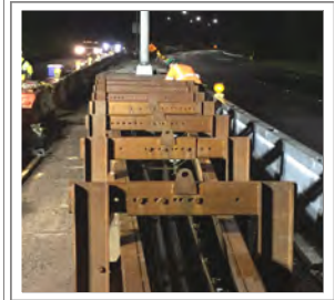
Transition forming from 9 1/4” top thickness to 54” wide to accommodate light posts

From the start, Todd Seki felt it was important to simplify the barrier forming process as much as possible. In his words, Todd wanted to “dumb-down” the forming procedures and worked with MFC to untangle potential complications and problems. The joint effort between Goodfellow and MFC was rewarded with actual field production yielding smooth and consistent concrete pours of 200 lineal feet of safety barrier per night.