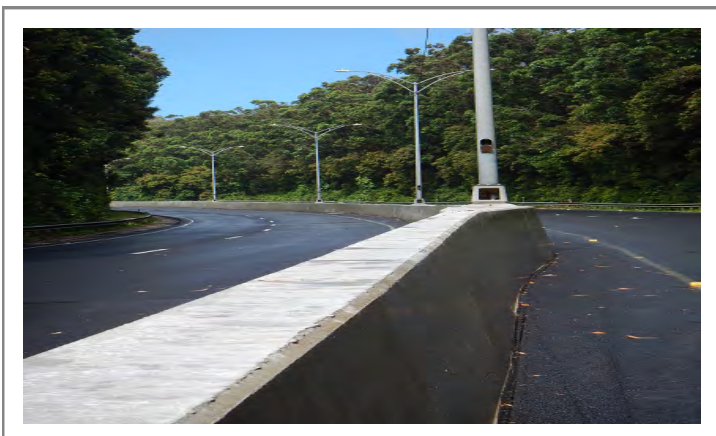
Completed section of center safety barrier on the $64M Pali Highway Project

Extensive communication between Goodfellow and MFC resulted in the fabrication of a job-specific set of steel forms having the ability to form both 32” and 46” high safety barrier. Each height (32” & 46”) also required the forming of transitions from 9 1/4” top thickness to 54” wide where the light posts were placed. The MFC engineering department produced over 50 drawings detailing all aspects of the forming system including adjustable moment arms, special transition lengths and heights as well as gang stripping/transport setups. A total of 1,000 lineal feet of forms was supplied for the project.