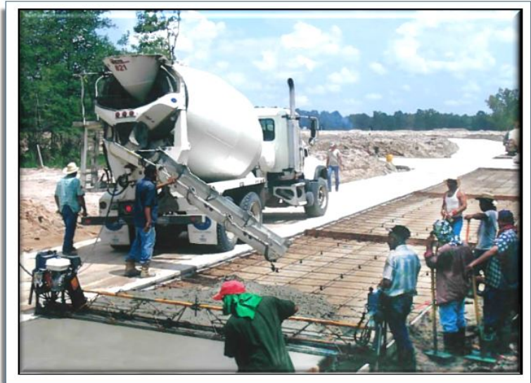
Houston Subdivision Paving

The relationship of MFC, CPSI and Beyer Construction illustrates a cooperative effort that leads to unparalleled success at all three levels of manufacturer, supplier and contractor.