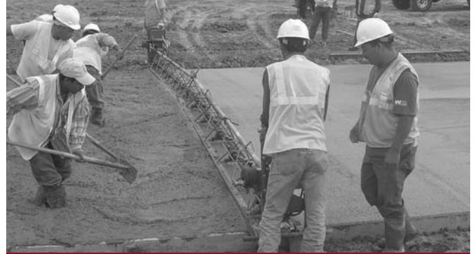
An MFC screed paves a new road in Texas.

"Initially, our customers requested some improvements to the screeds and Metal Forms listened ... beefing them up and making modifications to help the products better withstand the harsh Texas environment. Metal Forms continues to provide us with real time technical support.