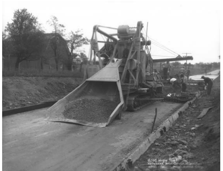
This 1931 photo shows Marchese Bros. Construction using Metal Forms forms to pave Good Hope Road in Milwaukee, WI. Even then we were known for the quality of our concrete paving forms.