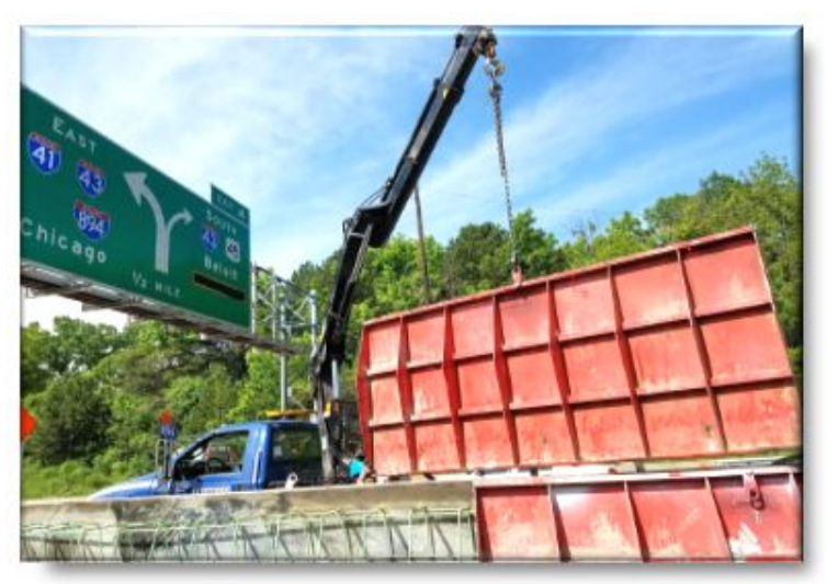
Milwaukee's Zoo Interchange Project

Zignego Company, Inc. (Waukesha, WI) played an important part in the overhaul of Milwaukee's Zoo Interchange which was the largest transportation project in Wisconsin State history. Part of the huge project required Zignego to place a large amount of concrete barrier in a short amount of time. Work could not start until spring and had to be completed before the start of Summerfest (World's Largest Music Festival) in late June.