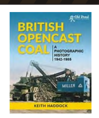
Int'l Specialized Book Service www.isbs.com

Believing that the majority of our readers are involved in the construction industry, I assume most of you marvel at the magnificent machines that have been developed for paving roads, building bridges and retrieving our natural resources. At the heart of all this machinery is earthmoving equipment.