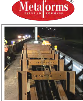
Transition forming from 9 1/4" top thickness to 54" wide to accommodate light posts

From the start, Todd Seki felt it was important to simplify the barrier forming process as much as possible. In his words, Todd wanted to "dumb-down" the forming procedures and worked with MFC to untangle potential complications and problems. The joint effort between Goodfellow and MFC was rewarded with actual field production yielding smooth and consistent concrete pours of 200lineal feet of safety barrier per night.