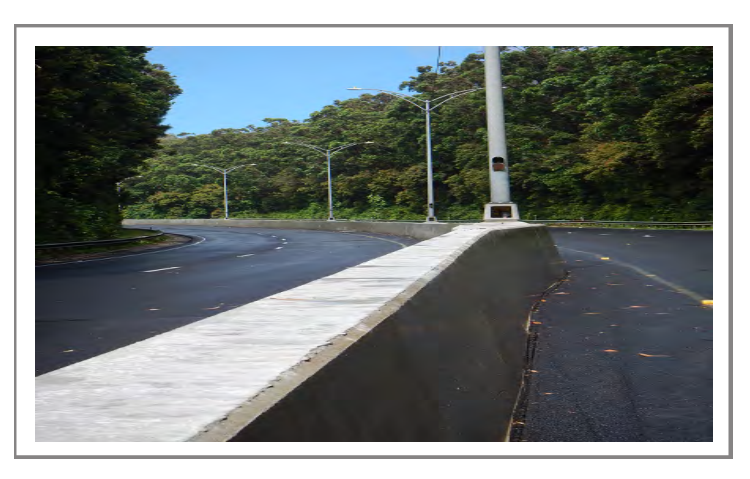
Completed section of center safety barrier on the $64M Pali Highway Project

Extensive communication between Goodfellow and MFC resulted in the fabrication of a job-specific set of steel forms having the ability to form both 32" and 46" high safety barrier. Each height (32" & 46") also required the forming of transitions from 9 <sup>1</sup>/<sub>4</sub>" top thickness to 54" wide where the light posts were placed. The MFC engineering department produced over 50 drawings detailing all aspects of the forming system including adjustable moment arms, special transition lengths and heights as well as gang stripping/ transport setups. A total of 1,000 lineal feet of forms was supplied for the project.